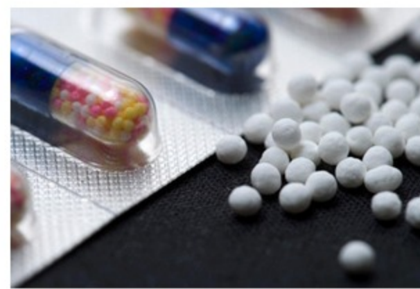
The ministry decided to give the five therapies the benefit of the doubt

After being rejected in 2005 by the authorities for lack of scientific proof of their efficacy, complementary and alternative medicines made a comeback in 2009 when two-thirds of Swiss backed their inclusion on the constitutional list of paid health services.